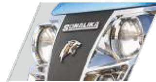
Twin Barrel Headlamps