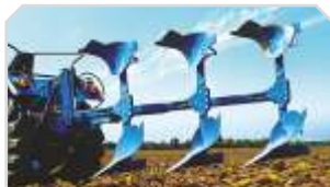
3 MB Plough