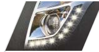
Super Luxe DRL