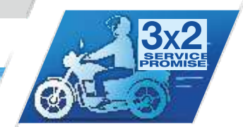
3x2 Service Promise Technician within 3 hours at your door step Complaint Addressal within 2 Days

The Sonalika Tiger series is a first-of-its-kind tractor designed in Europe and made in India to match the needs of young Indian farmers. Built with latest technological features, it is ideal for high-end agricultural applications. Sonalika Tiger series is all set to rule the future of precision farming in India. Call 1800 102 1011 to book your test drive.