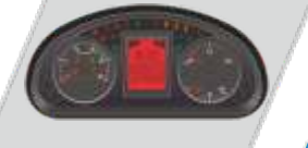
Luxurious Multi-function Console