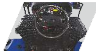
XL W-i-d-e Workspace