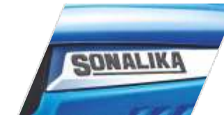
Premium Chrome Trims