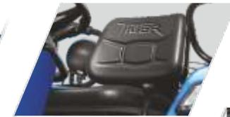
Plush Branded Seats 4-Way Adjustment