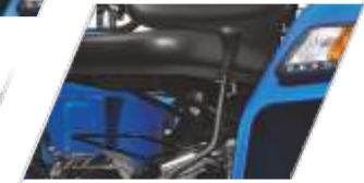
High Stance Seating 180 Degree View